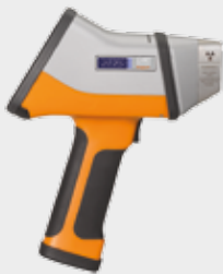
Handheld X-ray fluorescence

Surface treatments for parts operating in the most extreme conditions must be controlled within tight tolerances. Ensure coatings specifications are met to prevent product recalls and potentially catastrophic failures.