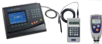
Magnetic / eddy current gauges for coating thickness measurement