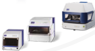
X-ray fluorescence analysers for coating thickness measurement, materials analysis, process control and quality assurance