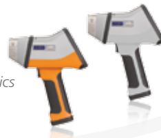
Handheld X-ray fluorescence analysers for fast non-destructive analysis of metals and plastics